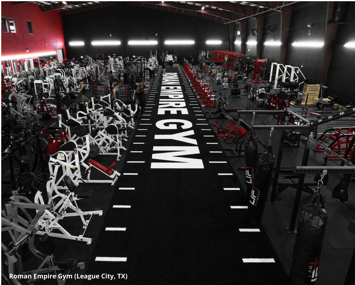
Roman Empire Gym (League City, TX)