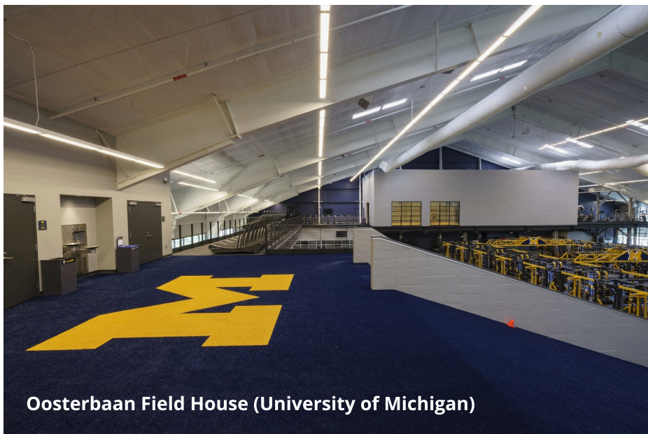
Oosterbaan Field House (University of Michigan)