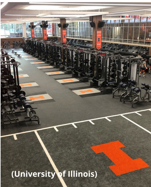
(University of Illinois)