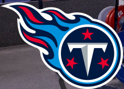
Saint Thomas Sports Park (Nashville, TN)